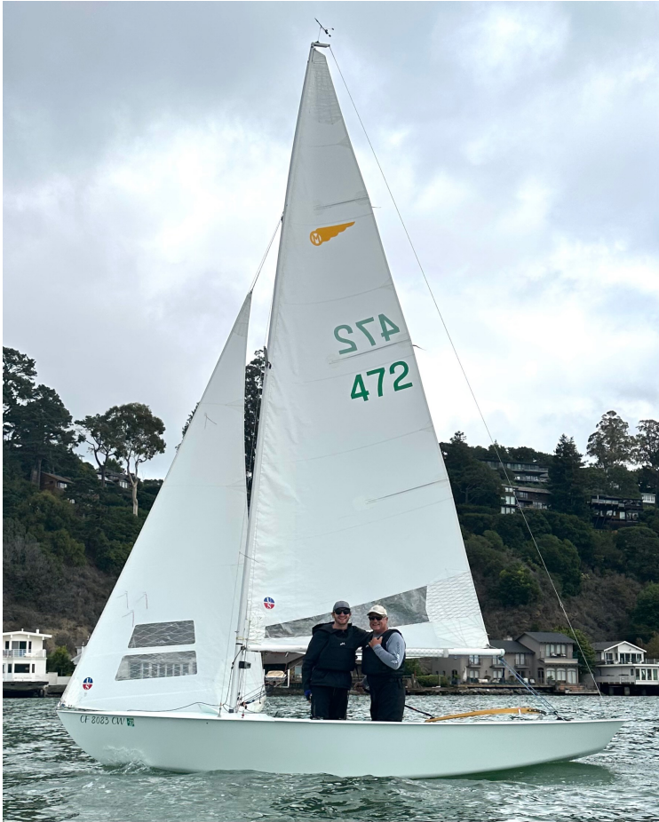
2023 National Championship Regatta At San Francisco Yacht Club